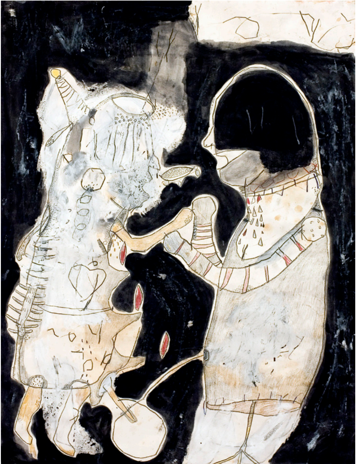
"this mortal coil" mixed media on paper 18x23.5 in.