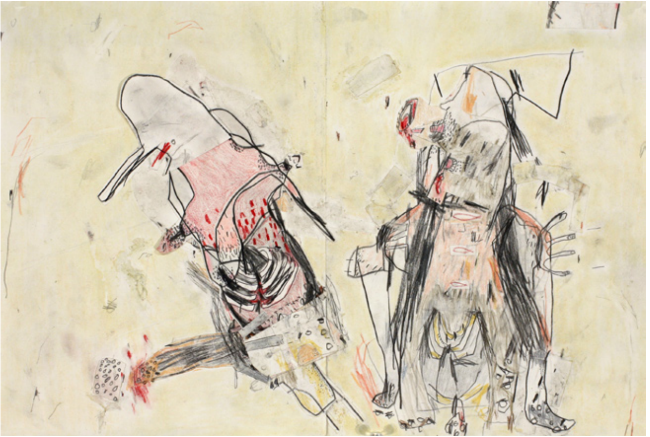
“choice of outfits for the agonies of mary” pencil, colored, marker, and chalk on paper 11x17in.. / june 2006