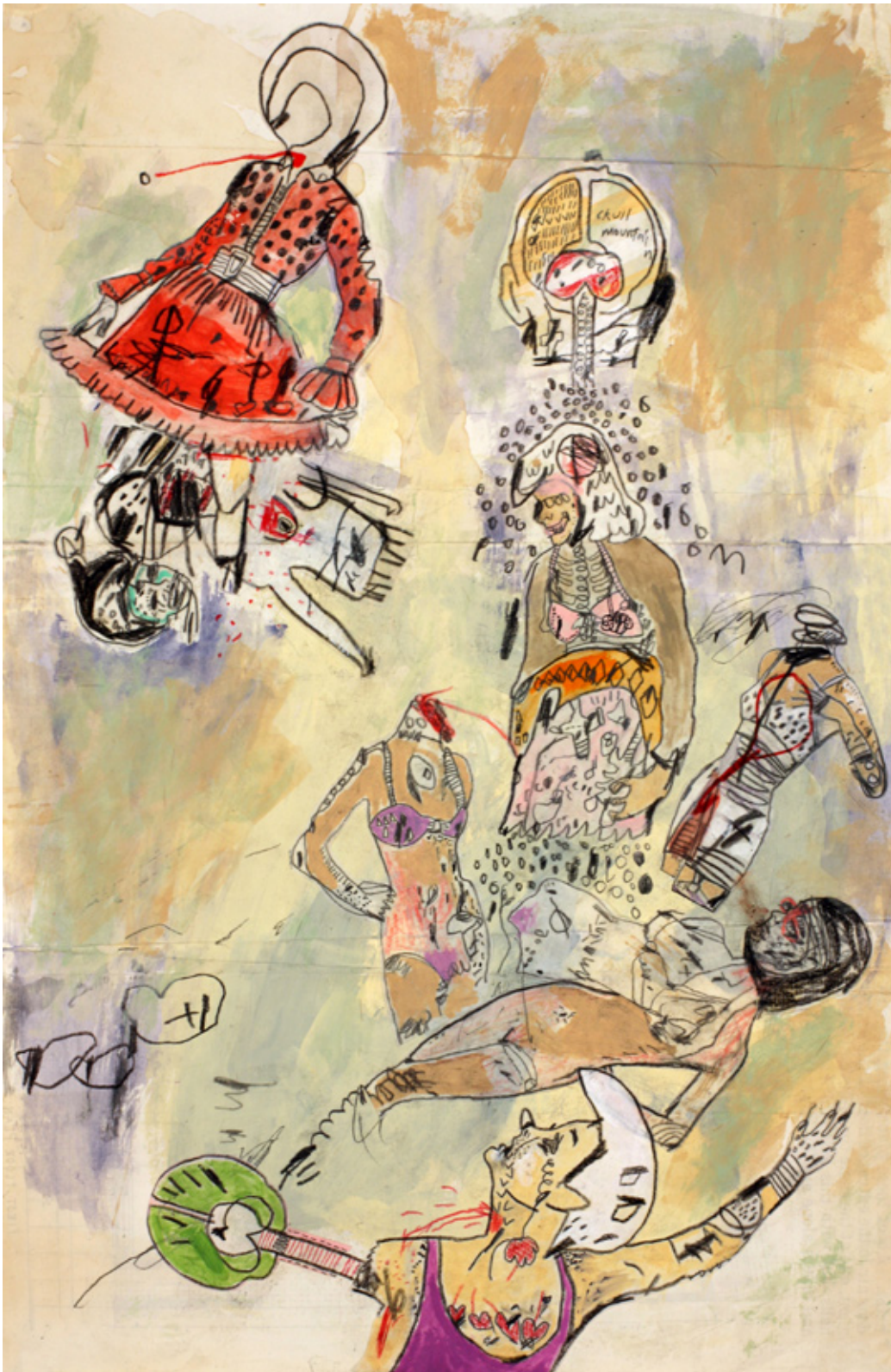
"shaved legs nosebleed" pencil on paper 11x17 in. / november 2005