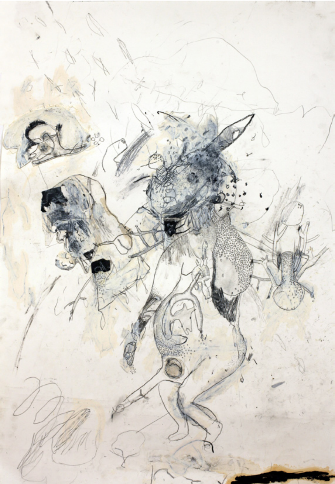
"in the basement hugging the gas main." mixed media on paper. 26x38 in.