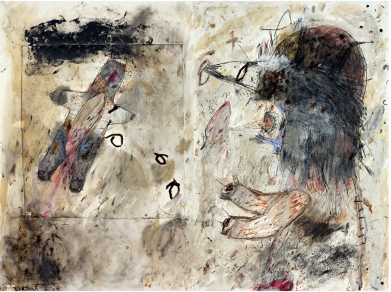
“how to recycle a placenta” mixed media on paper. 38x50 in.