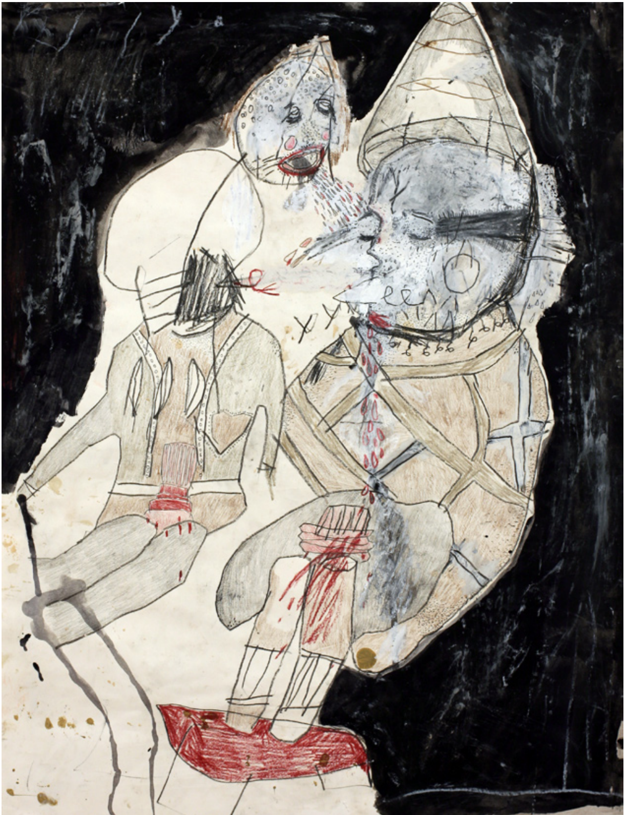
"my poison egg" mixed media on paper. 18x24 in.