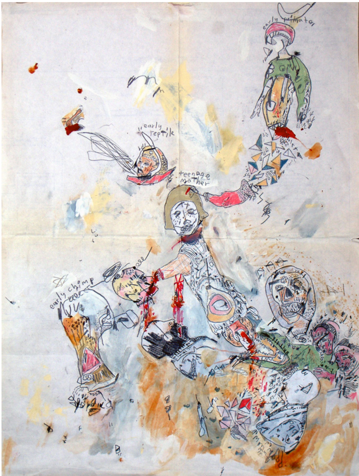
"menstruation cycle" pencil and ink, collage on paper 11x17 in. / july 2003