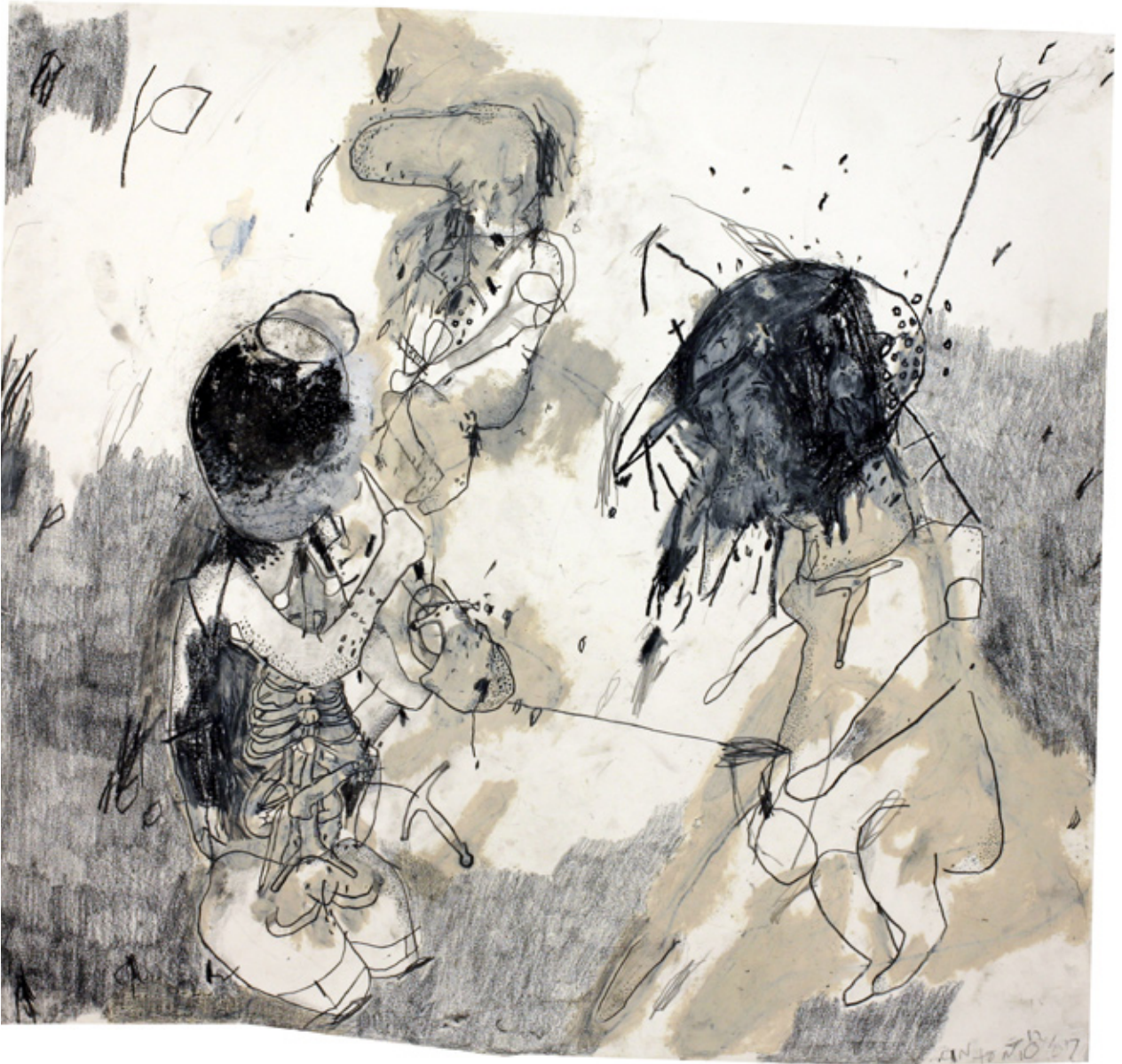
“single hurt color” mixed media on paper. 26x24 in.