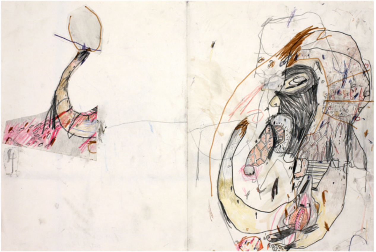
“collector of fluids” mixed media on paper 11x17 in. / june 2006