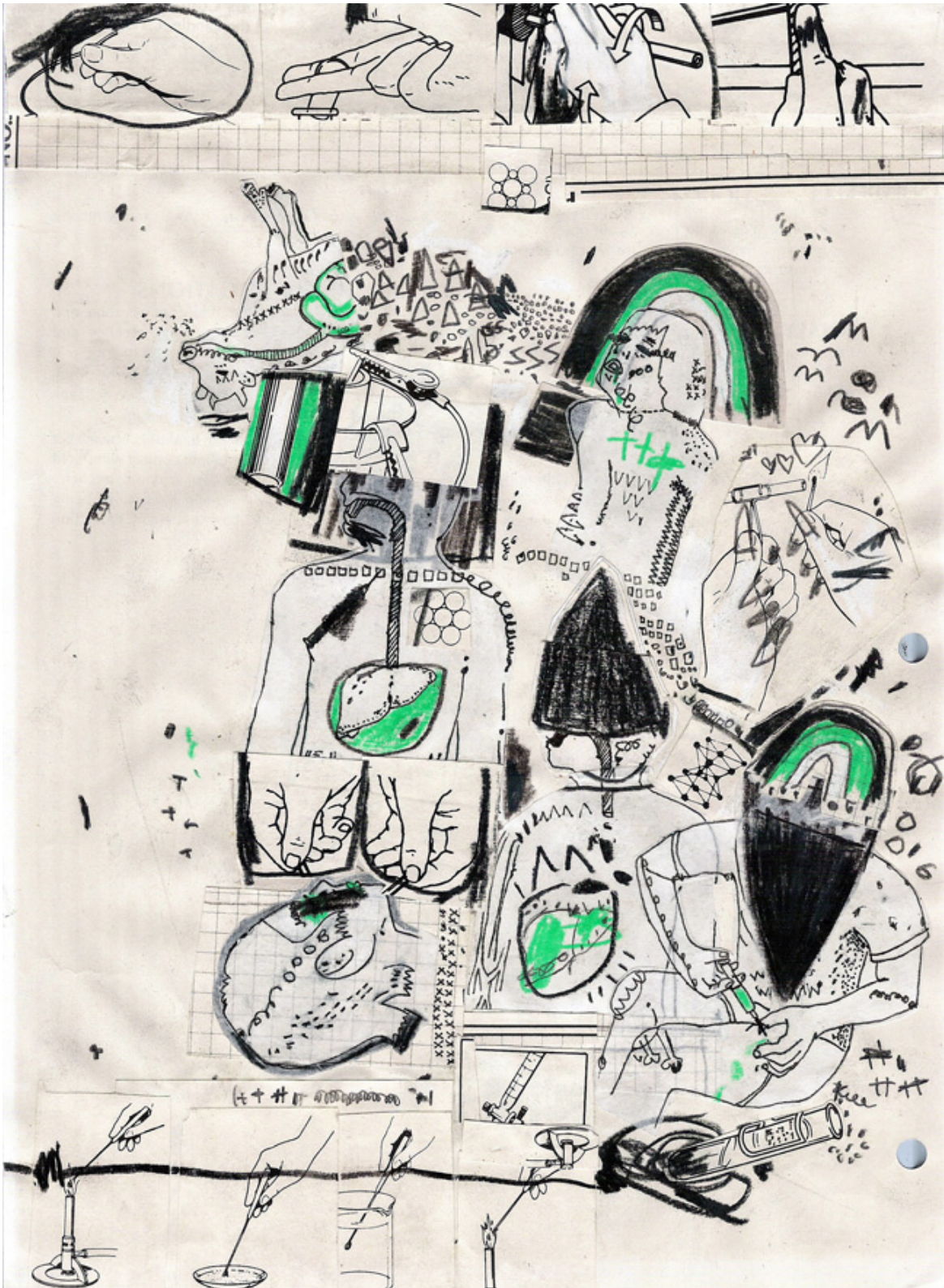
"evidence" pencil and ink, collage on paper 8.5x11 in. / january 2004