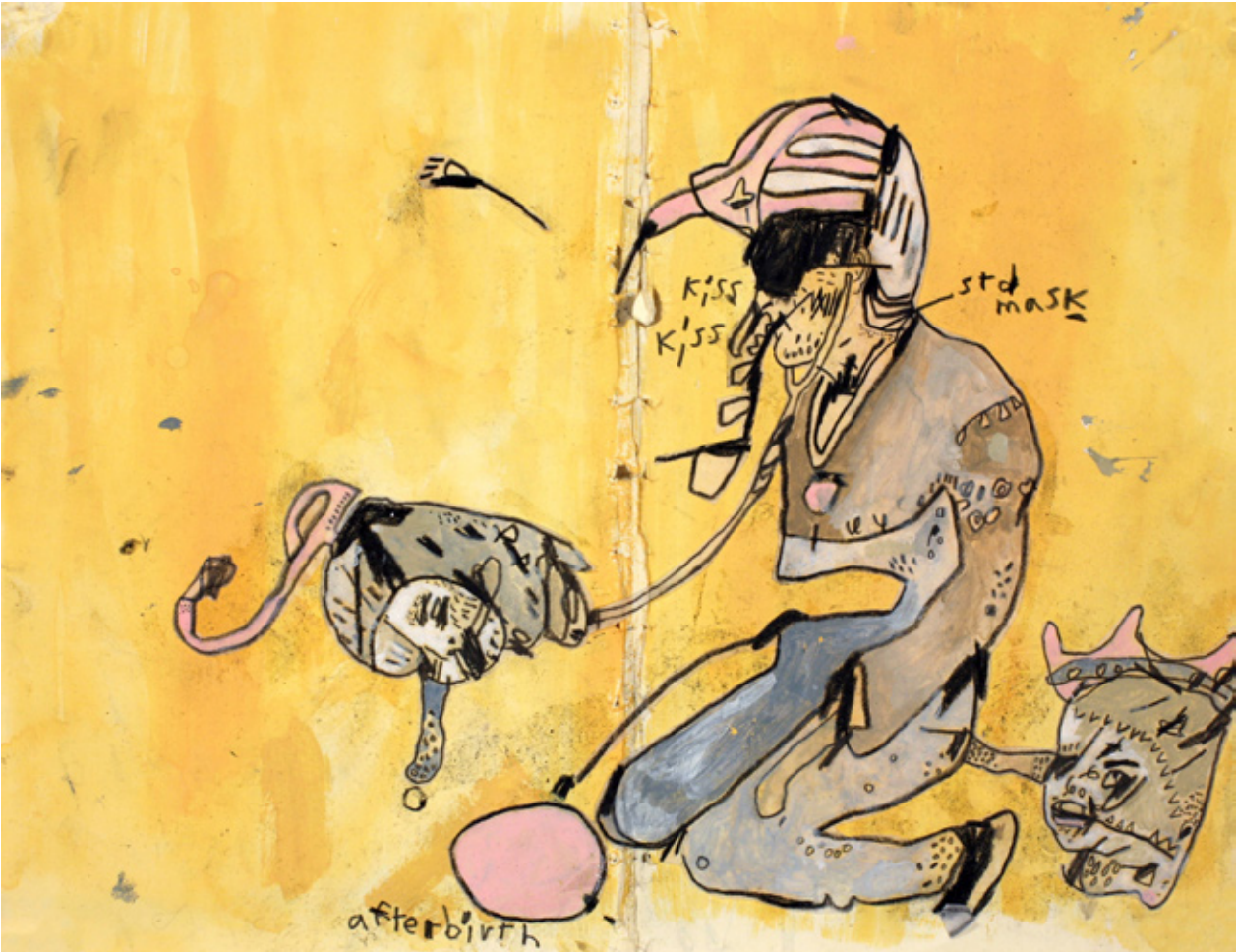
"hiv5" mixed media on paper 10.5x8 in. / november 2004